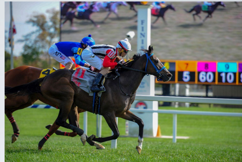
To racing in Maryland!