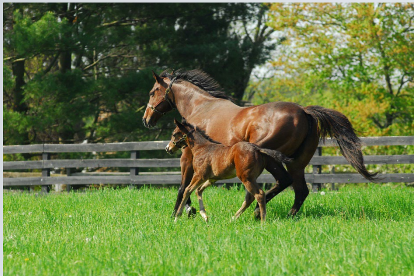
From foaling in Maryland...