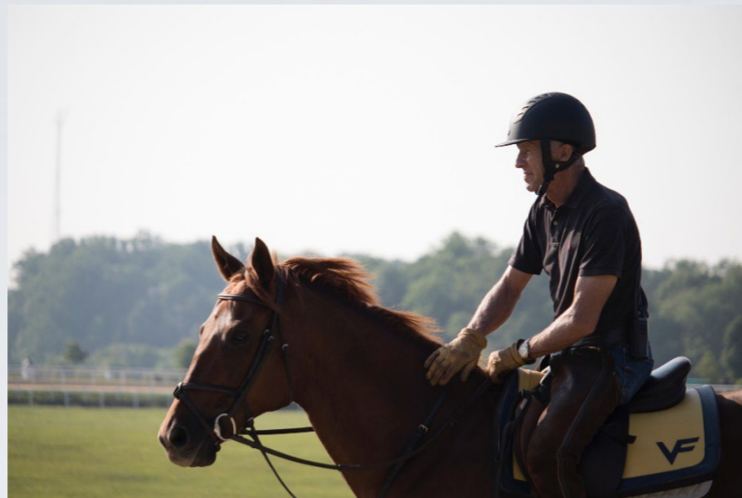
To training in Maryland...